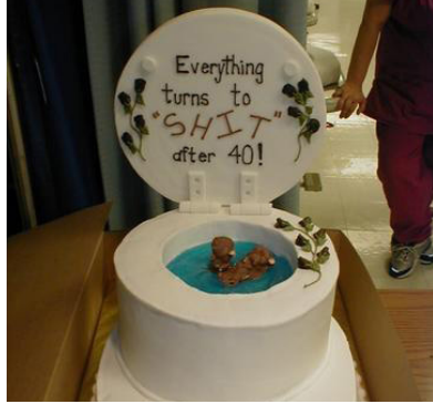
No matter how it looks, cake is delicious - even this creatively shitty cake!

that hound them. The nature of this confection makes a wonderful material for temporary houses, one which doubles as a store of food in times of famine. Legends speak of a crafty witch who recognized the unique properties of cake as both a squishy, pliable material suitable for the construction of a house